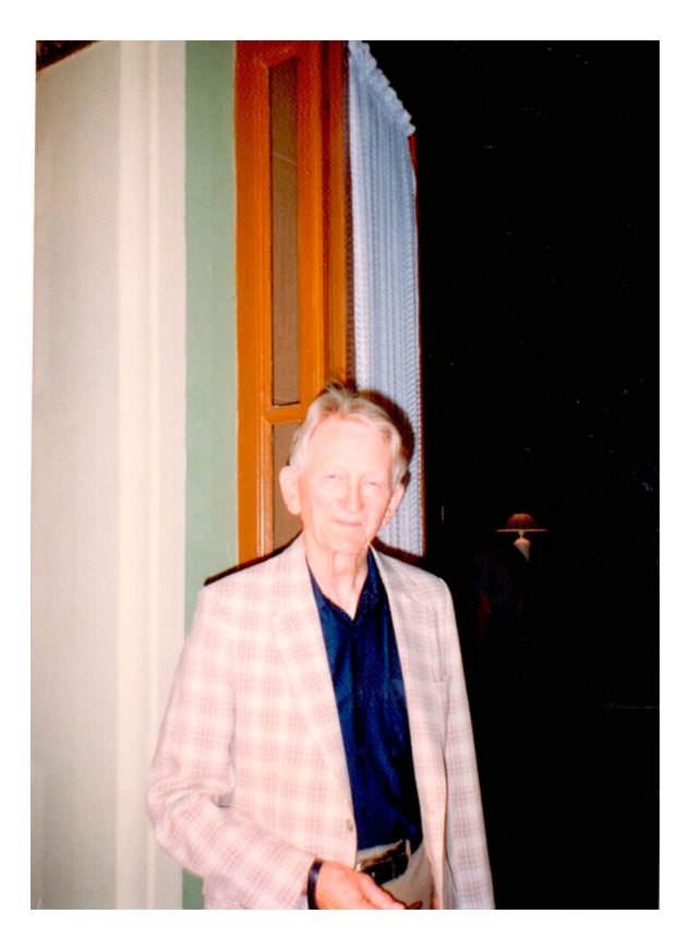
Figure 3. Selberg in Lillafüred

Since Erdős was very talented in matching mathematical problems with the optimal mathematician, one might ask whether he was a good judge of character. Did he suspect, knowing Selberg's personality, that he might not give him the credit