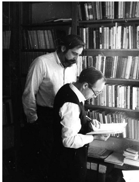
FIGURE 2. Raoul Bott with Michael Atiyah, Oxford 1975.

Riemann–Roch in the algebraic category had a tremendous effect on all our thinking. Nevertheless the ideas of Atiyah and Hirzebruch, interpreting the periodicity theorems as ‘Kunneth’ formulae in an ‘extraordinary cohomology theory’ came as a complete surprise to me! In one swoop my special computations had become a potential tool in all aspects of topology.